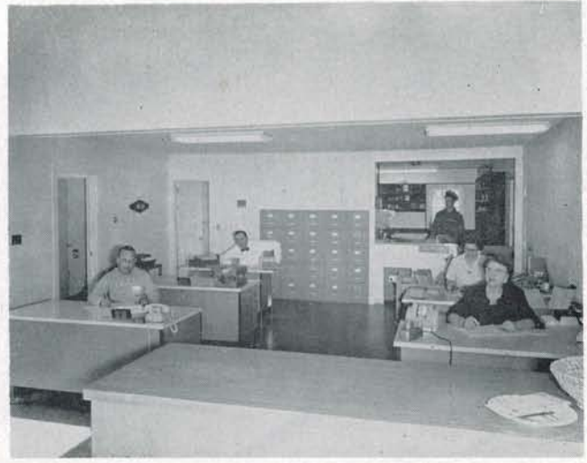
The office area reflects the immaculate decor that encompasses the entire Kearley plant, which is kept spotlessly clean — an excellent image for clean and modern oil heat. The building has a floor area of about 5,500 square feet, of which the garage is about 3,300 square feet. The garage height to the roof peak is 30 feet.