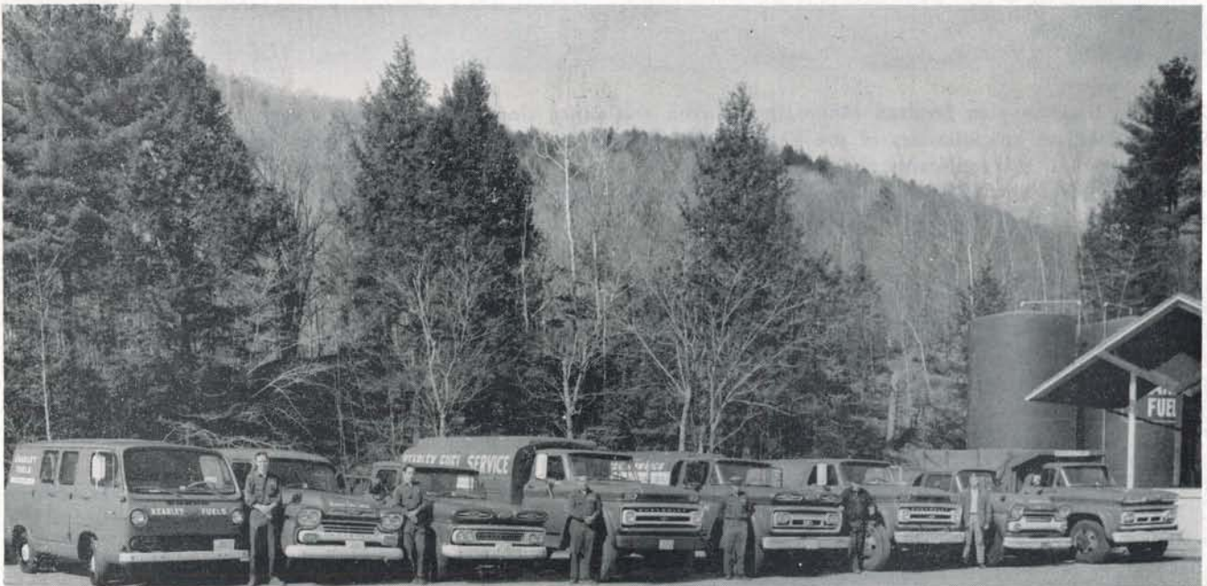
There are 10 vehicles in the Kearley fleet, of which three are in the service category. A cardinal rule of the company is that all of them are kept clean and polished at all times, even when the roads become sloppy and slushy. The drivers take pride in maintaining themselves and their vehicles. The number of employees fluctuates seasonally, averaging 10 year round, with seven working outside in either delivery or service.