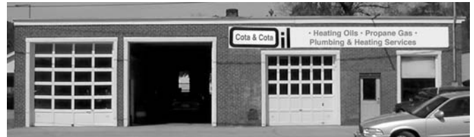
Our White River Jct. office located at 8 Barnes Ave., White River Jct., Vermont. Directions: Intersections of I-91, US RT 5 & US RT 14.

Cota & Cota provides prompt and professional service with our industry recognized service department. Comfort Care coverage is available to our heating oil and propane gas customers 24 hours a day, 7 days a week. Just call 295-0000 or 888-COTA.OIL.