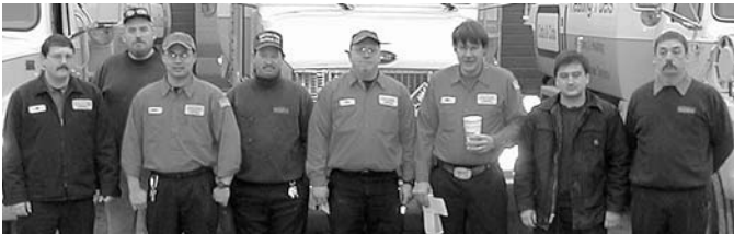
Thank you from our Delivery Drivers!

To all our customers who help make a delivery path to your fill pipe. Our delivery drivers think you are tops!!!!