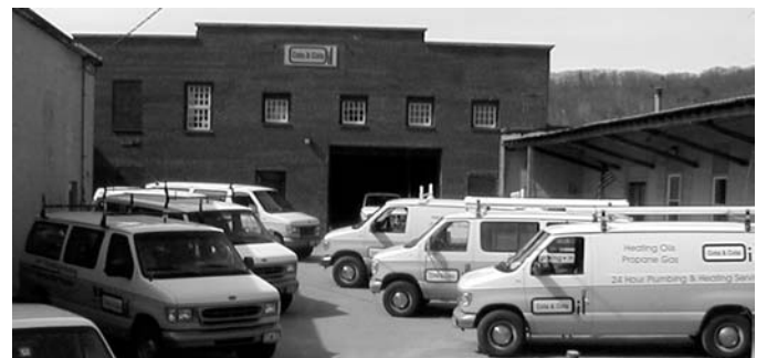
"The Creamery" today - Cota & Cota Parts & Service Warehouse.