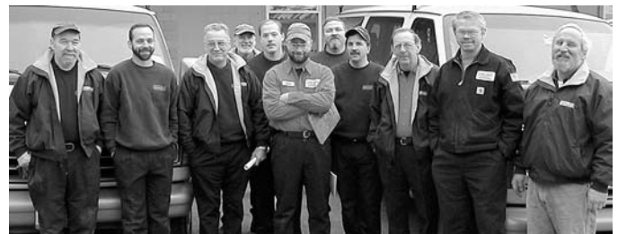
Thank you from our Service Team. These are just some of our certified Technicians.

Our propane technicians are becoming recognized as the best in their field. Our technician's skills are to the level that they are instructors for the industry. For reliable service and great propane value... call us for all your propane needs.