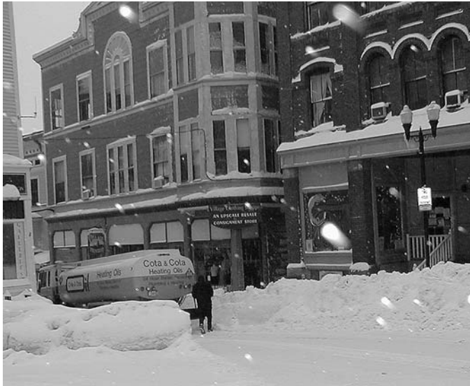
Downtown Bellows Falls, March 2001.