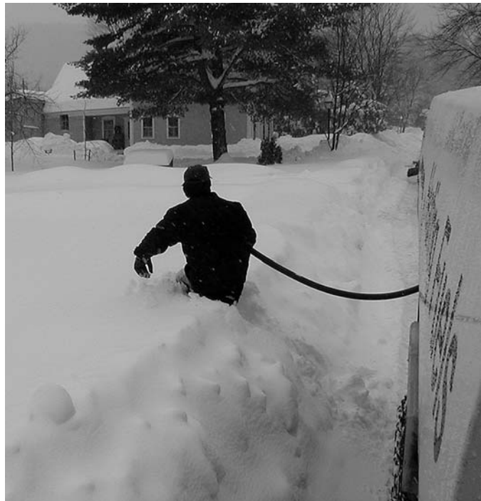
Blizzard of 2001 - Snowbanks were more than knee deep in some of our delivery locations.

In situations where a driver simply could not make it up a particular driveway, they radioed our office staff, who in turn called those customers and asked them to check their tank levels or to call us back when their driveways were passable. Again, we want to thank you for your efforts during the blizzard of 2001!