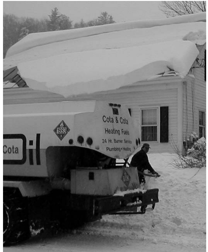
With the accumulation of the past two snow storms, our delivery drivers worked extra hard and faced a variety of challenges.

We are proud of our delivery drivers. They made every effort to make sure that no one ran out of heating fuel.