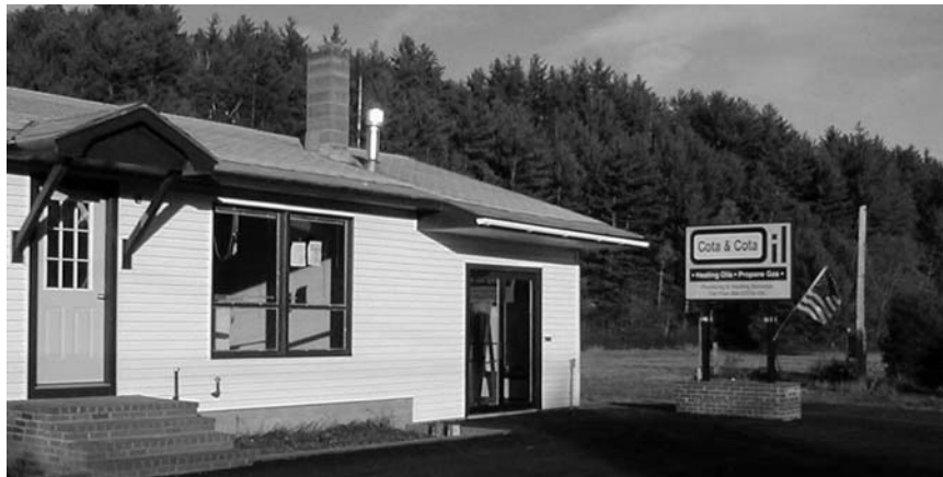
Our Ludlow Branch Office is now located on 7 Main Street.

Cota & Cota services the Ludlow area with heating oil, kerosene, and propane gas. We also provide Scul-Tel™ 24 hour low temperature protection to protect your house when no one is there. Simply, the sensor in your home activates a digital telephone call to our 24 hour computer.